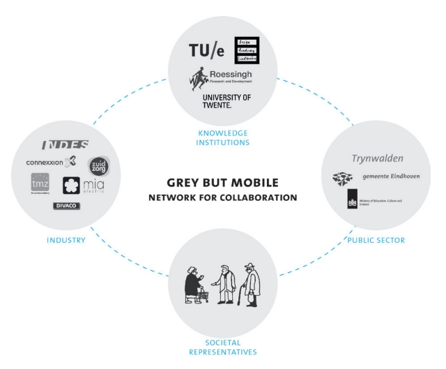
FIGURE 1: Project partners within Grey but Mobile

The authors come from the Design Academy Eindhoven, which is considered a knowledge institute on Figure 1. However, the DAE positions itself in a space between academia and creative industries where people and organisations, such as the authors themselves, combine the two positions. This helps to build bridges within the network, supports an exchange between academia and creative industries, as well as positions this research between the two fields.